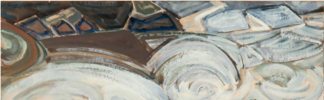
IMAGE — Guy Anderson, Place of Little Islands , 1960, gouche on paper; MoNA, gift of the Caterral Collection