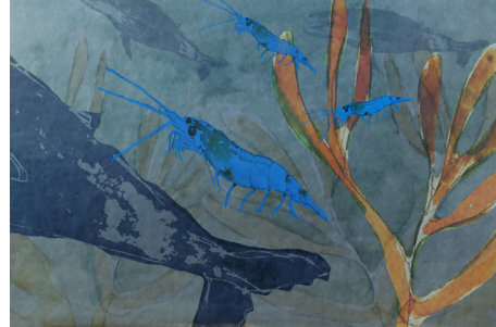
IMAGE — Rachel Lodge, Whale Tail , 2017, digital archival print, Carbon Storylines 1.1 , MoNA Outside In Gallery

For more information about our education programs contact us at education@museumofnwart.org .