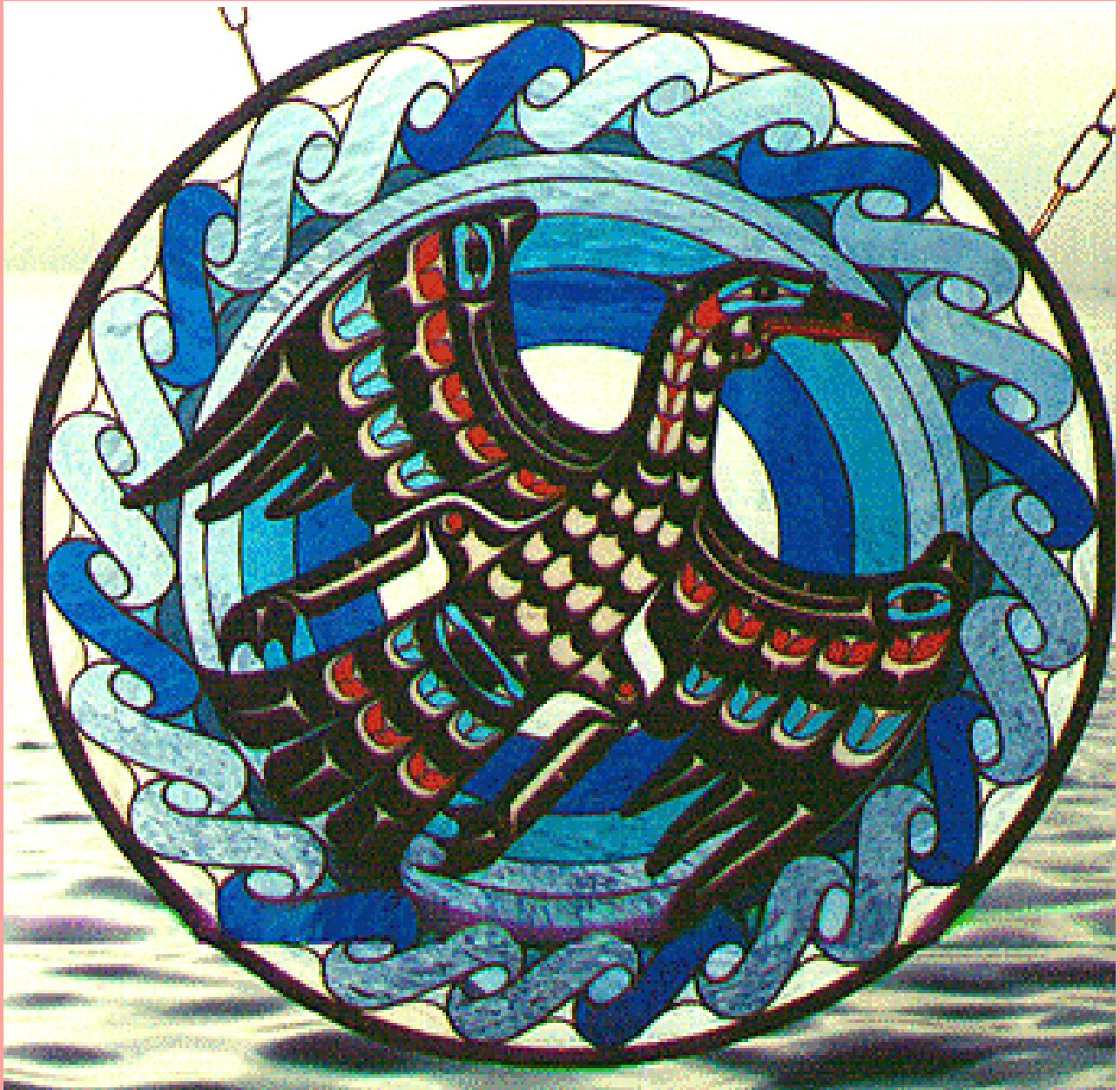
Aquatic Flight , Harold Alfred