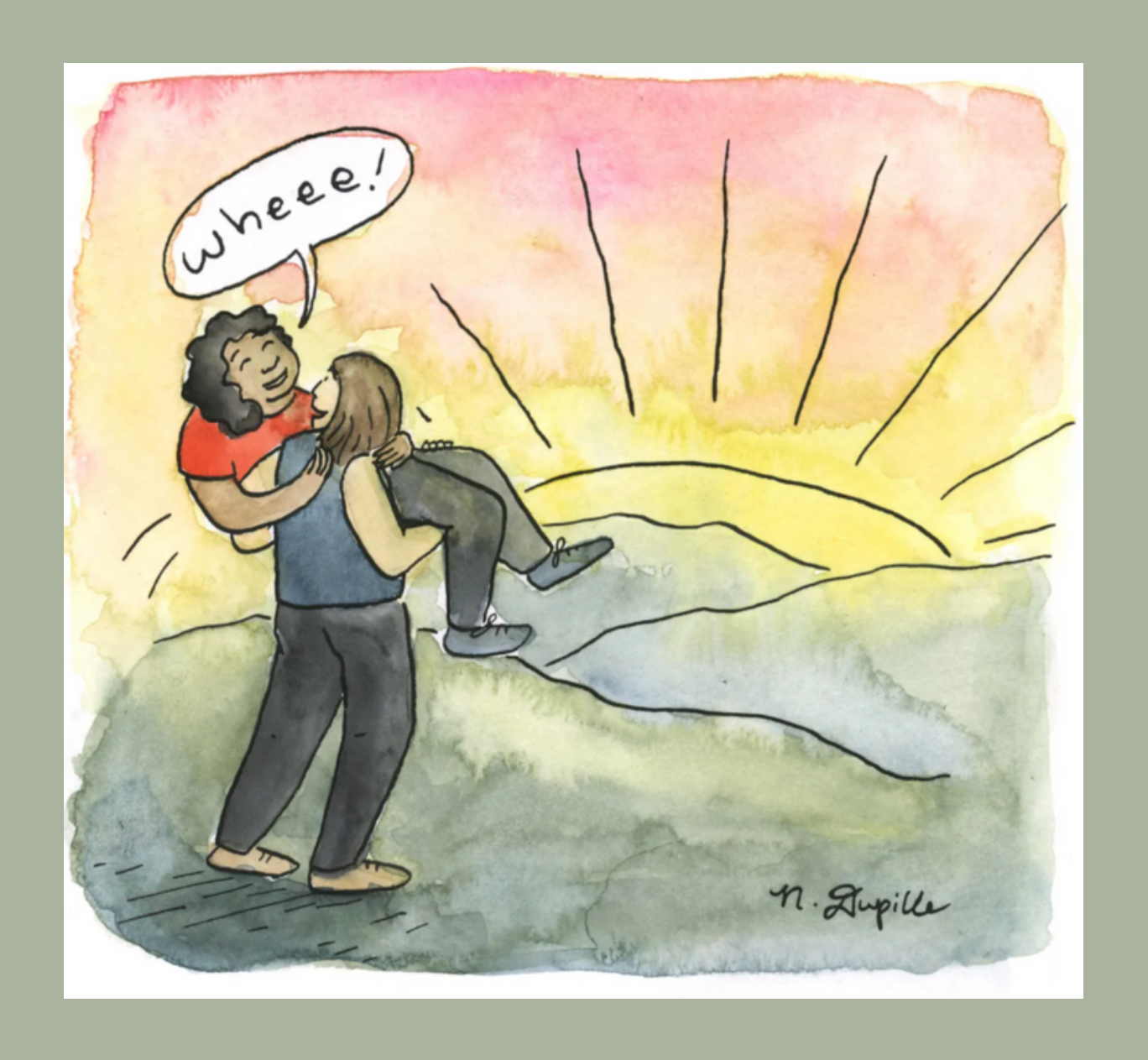
Image from How to Touch Again (Once we're allowed)