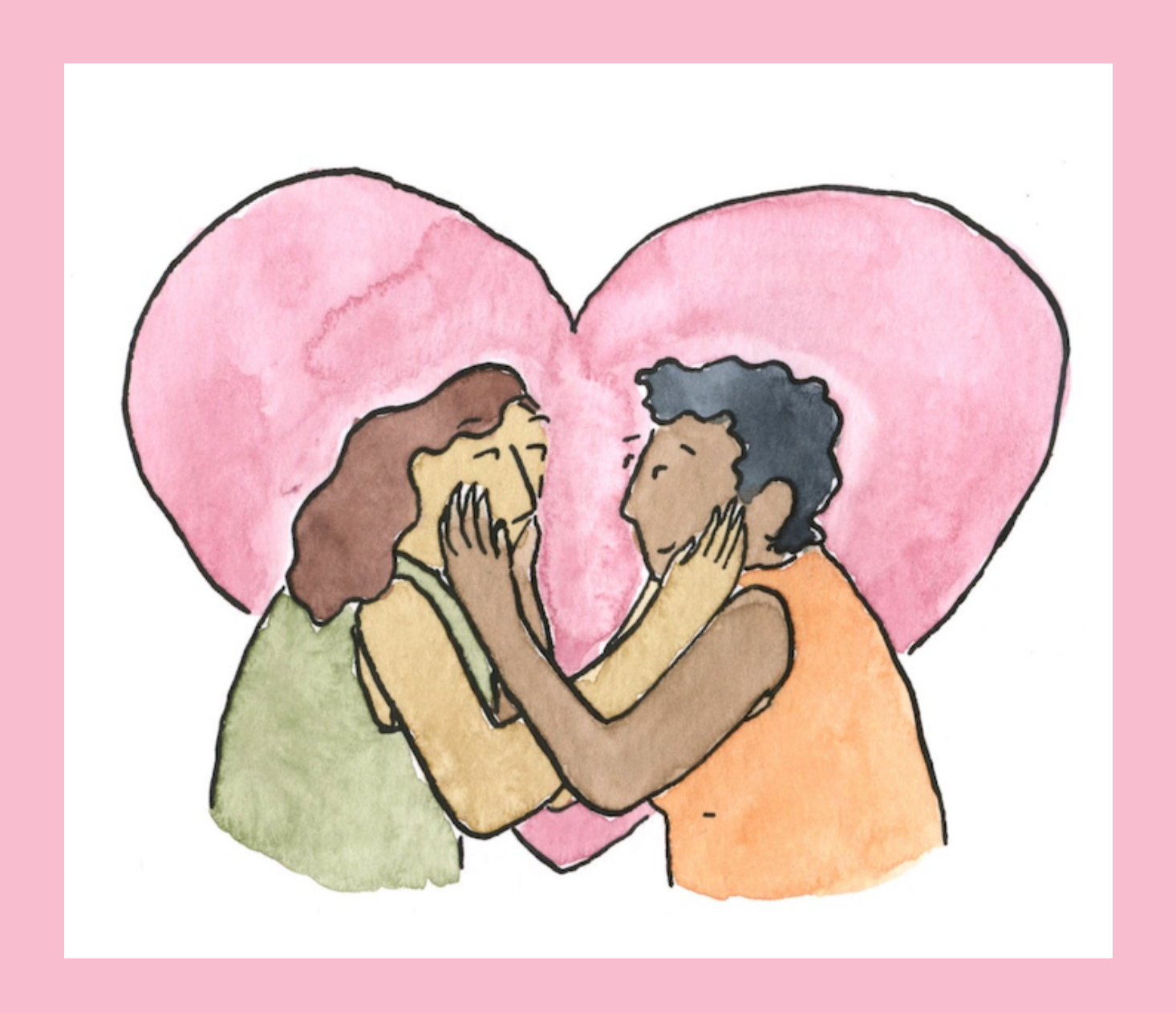
Image from How to Touch Again (Once we're allowed)