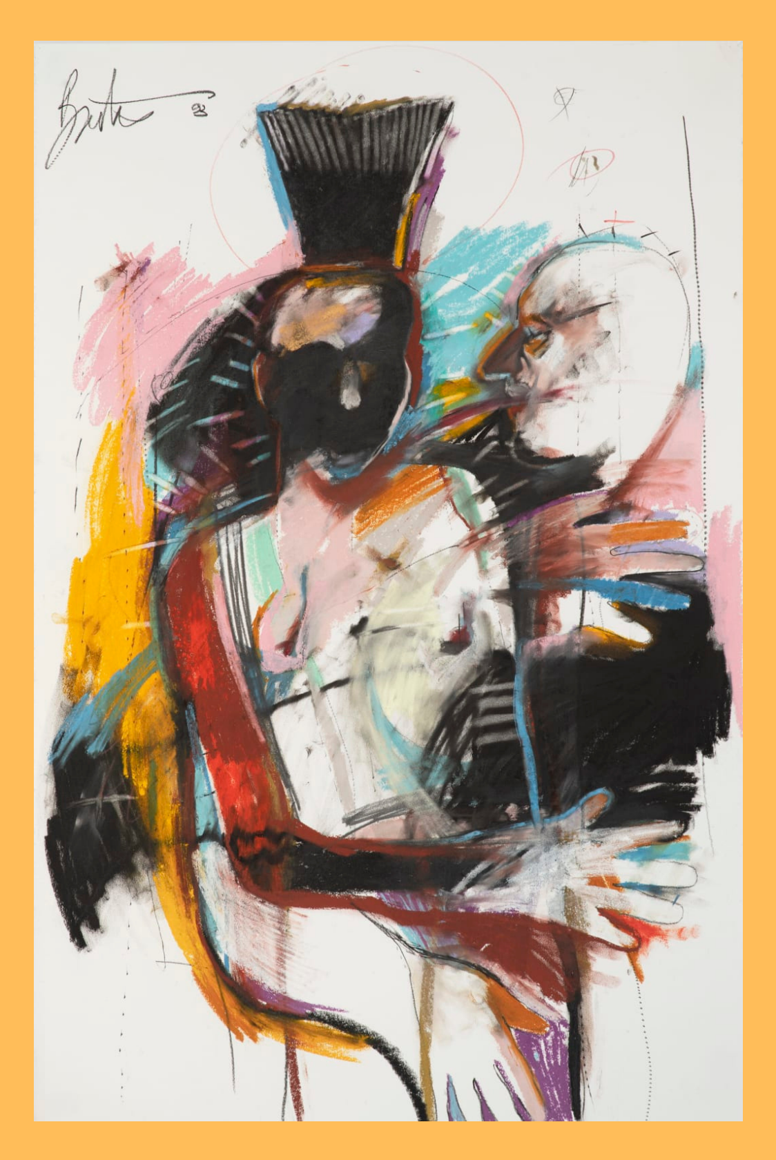
Salmon Song, 1993 Image Credit: Froelick Gallery