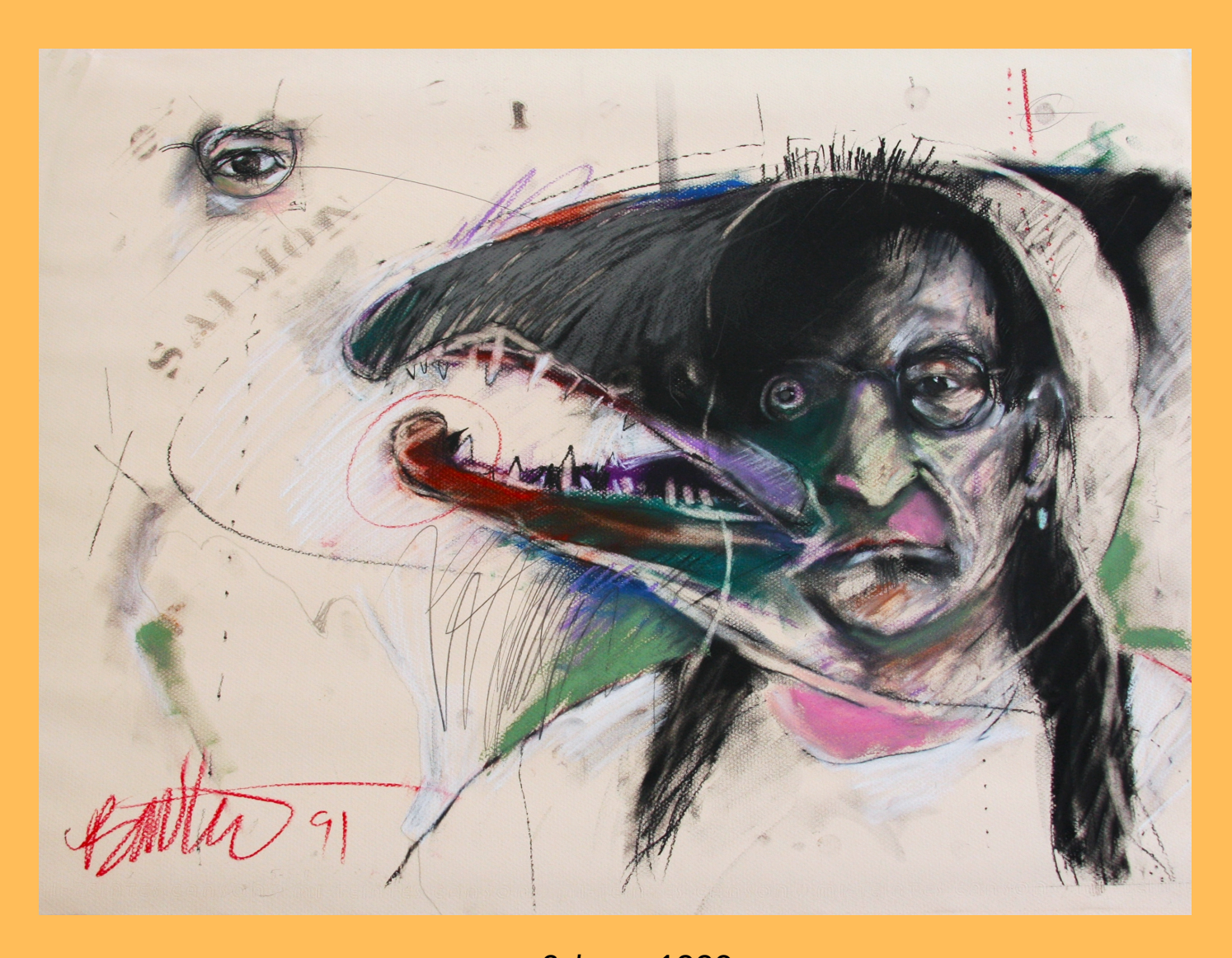
Salmon, 1990