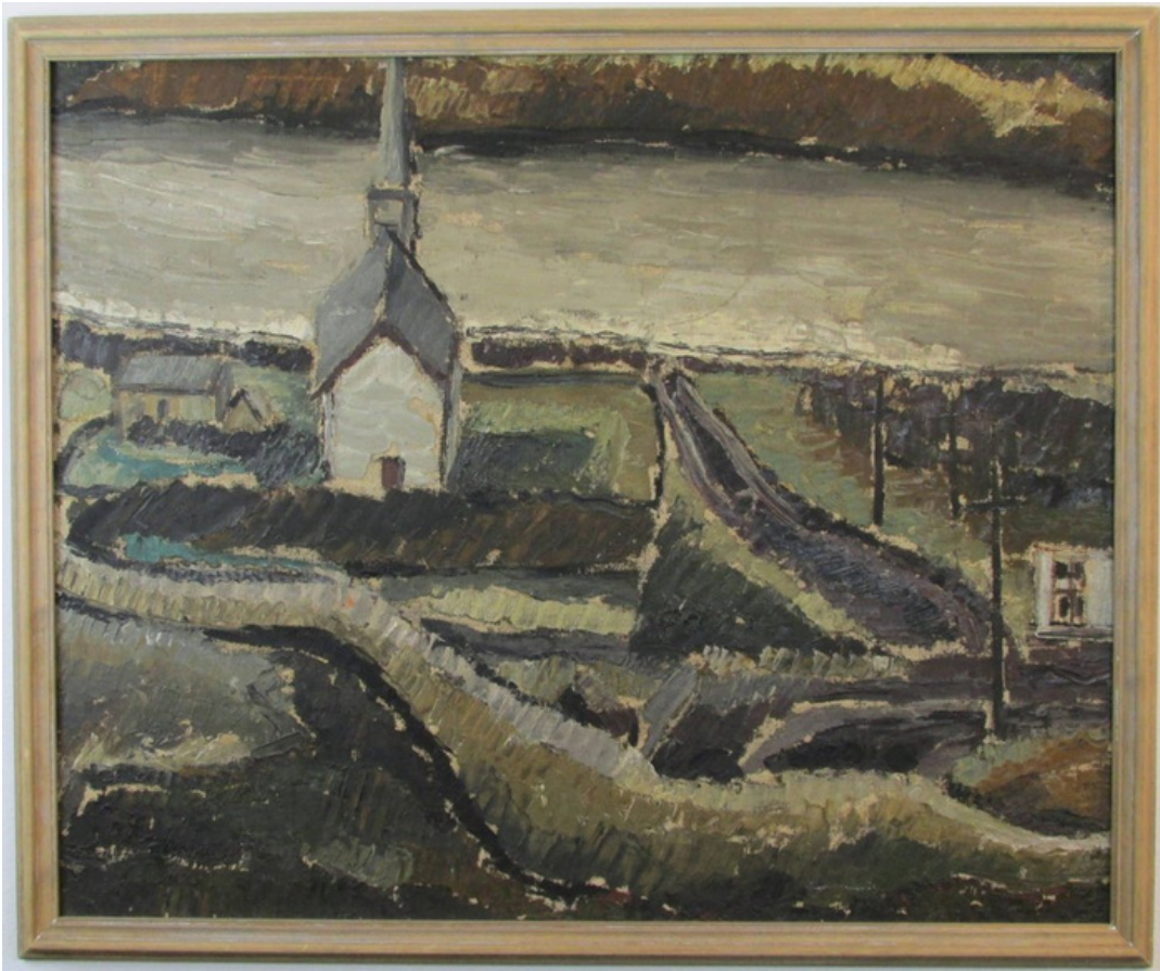
"Untitled (Northwest Landscape with Church)," Morris Graves, 1935, oil on un-sized Bemis bag on stretcher in frame, 27" x 33.25", MoNA Permanent Collection, gift of Mary Randlett

Building upon the vision of Hupy, Susan Parke who served as MoNA's Executive Director from 1990 to 2007, played a significant role in elevating the profile of the institution and establishing the Museum as a regional destination. During her tenure, Parke was instrumental in expanding the Museum's permanent collection, growing its scope and breadth beyond the Northwest School to strategically reflect a broader swath of artistic sensibilities—equally defining the Northwest art scene.