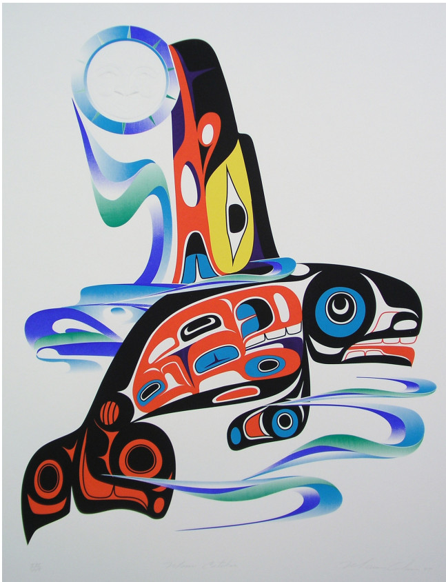
Moon Catcher by Marvin Oliver Image source: Alaskaeaglearts.com