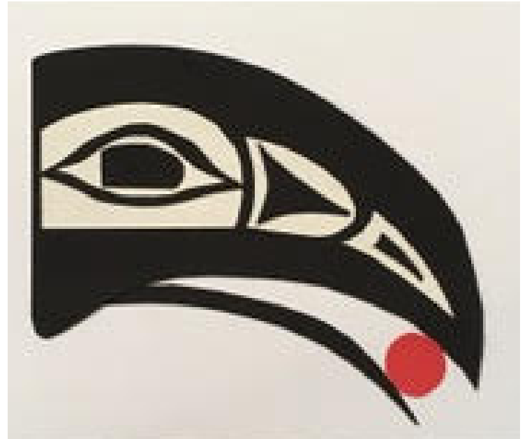
Example by Lynn Prewitt

A HANDS-ON ART ACTIVITY DESIGNED BY MONA EDUCATORS