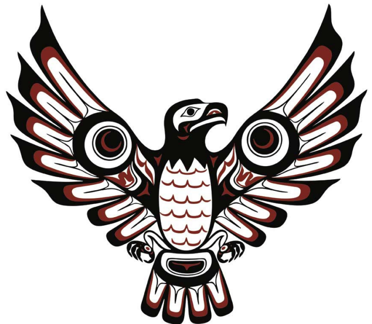
Haida Eagle II by Clarence Mills