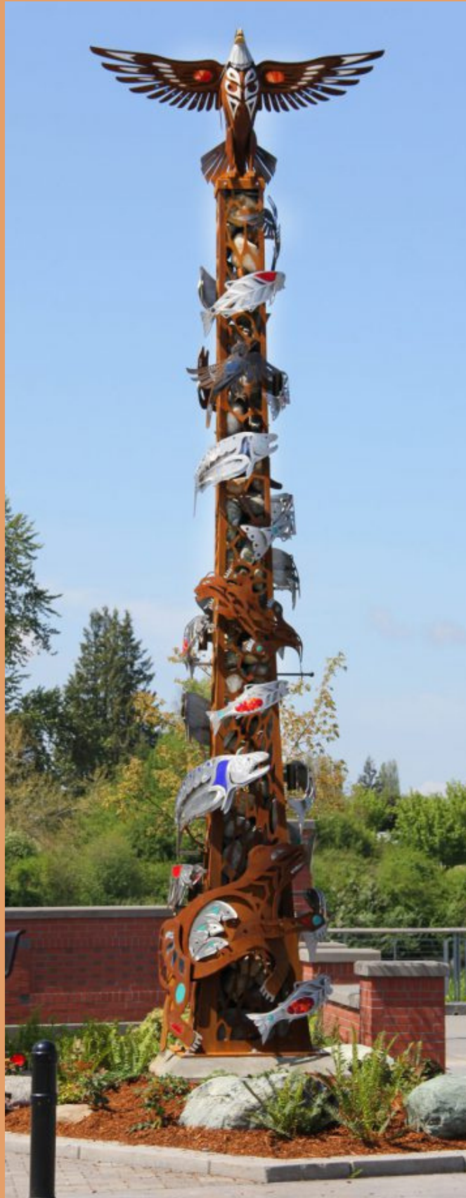
Spirits of Our Valley, Jay Bowen, Stainless- and weathered-steel structure

Image source: http://jaybowen-art.com/wordpress/valley-of-our-spirits-2/