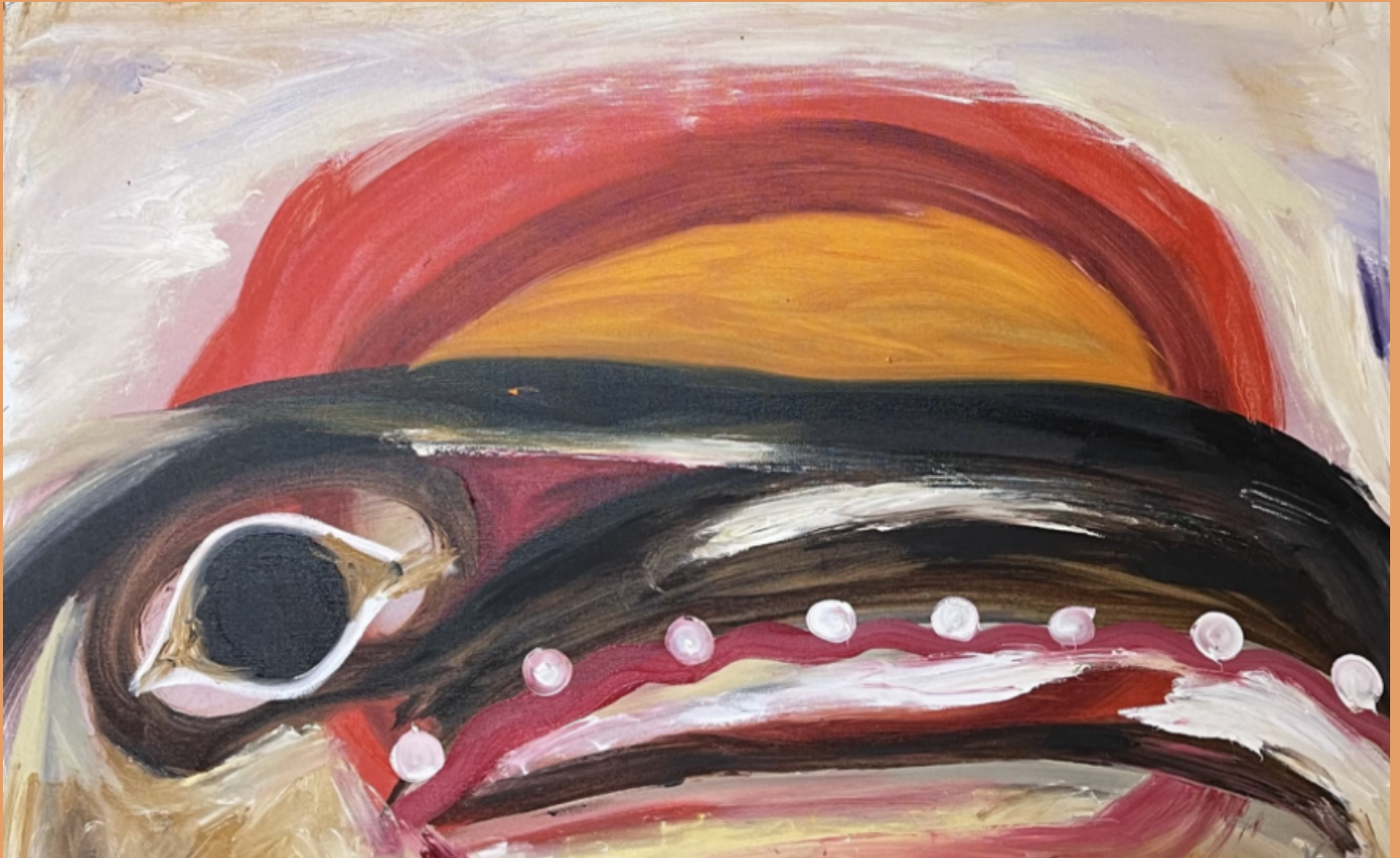
Wood Raven and Sun , Jay Bowen, Oil on Canvas