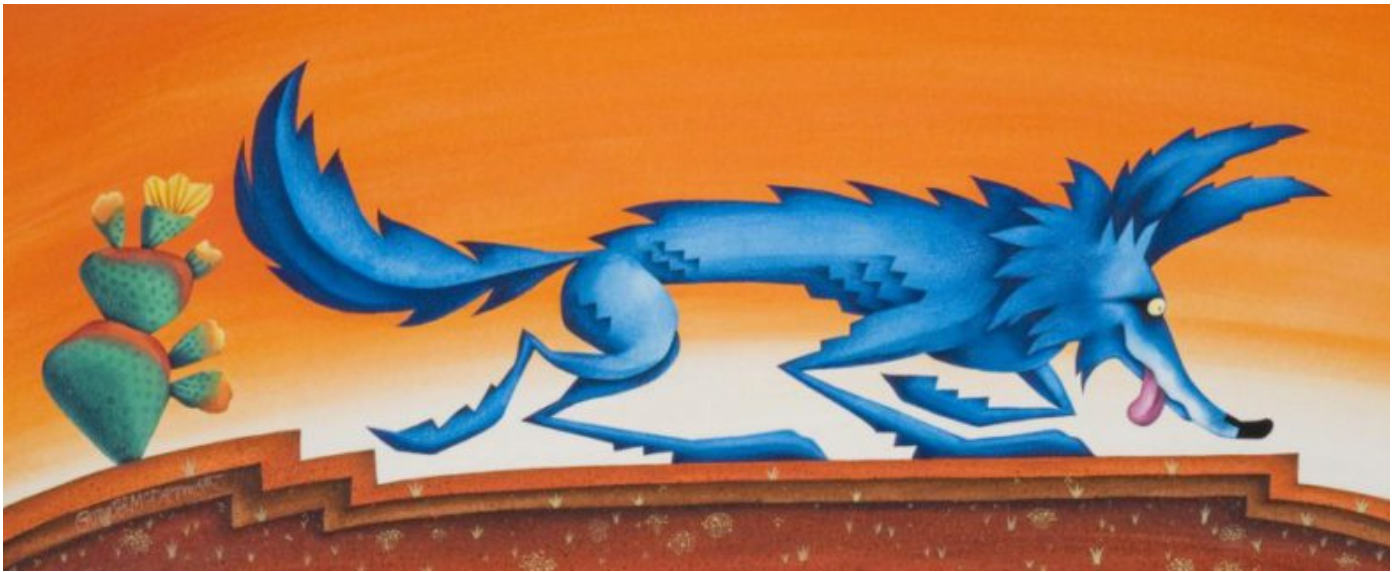
Image from Coyote by Gerald Mcdermott