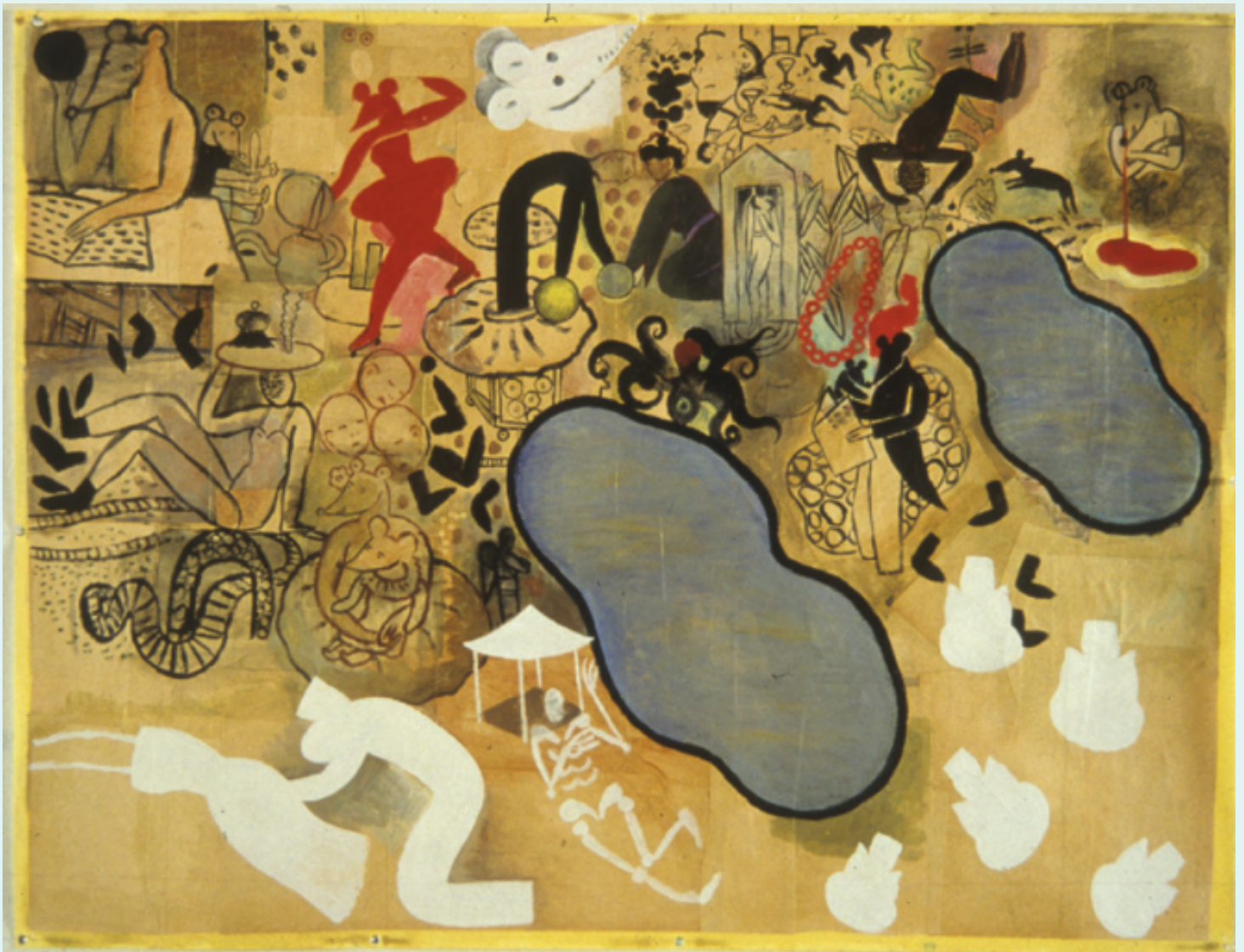
Fay Jones, "Two Pools: Riddle and Ghosts" 1992 Sumi, acrylic and collage on paper