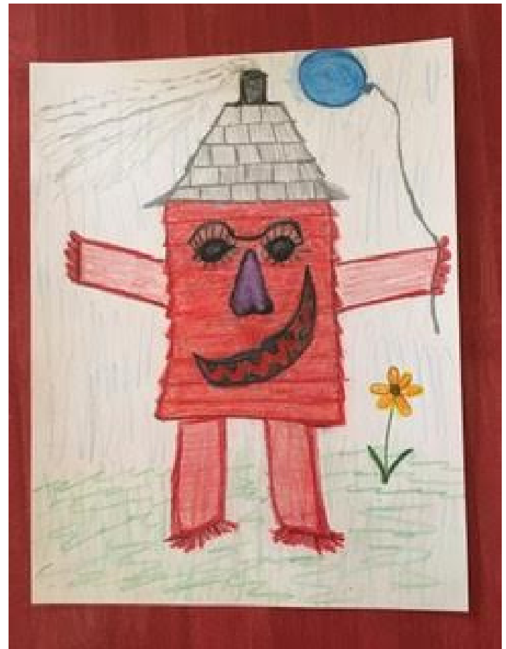
Example by Lynn Prewitt