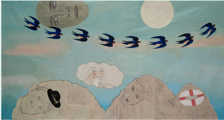
Fay Jones, "Memento Mori" 2019 Acrylic and collage on paper