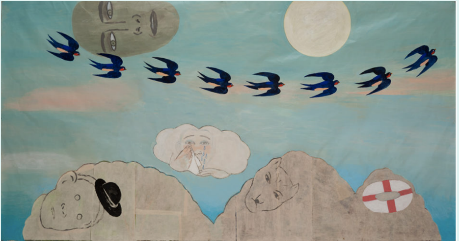
Fay Jones, "Memento Mori" 2019 Acrylic and collage on paper Image credit: jamesharrisgallery.com